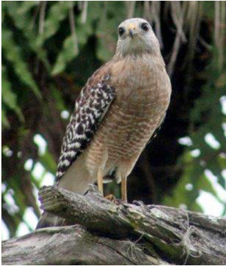
Photos of Red shouldered hawk and Sandhill cranes